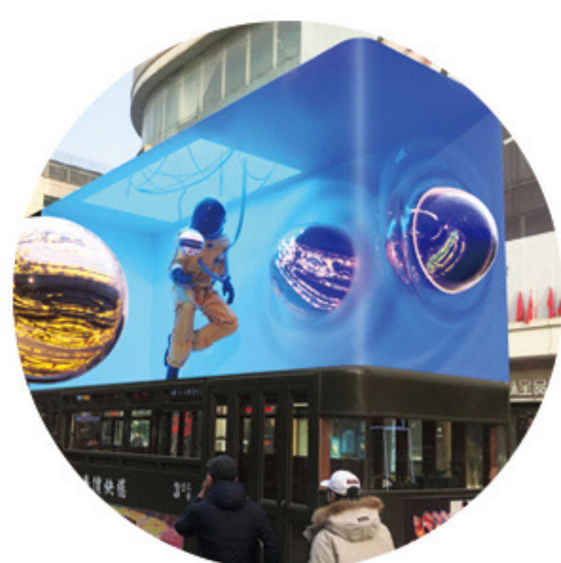
Outdoor Media Advertising